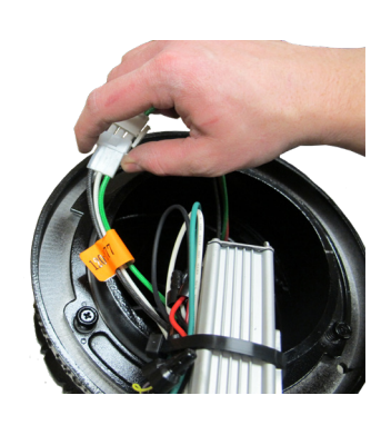
STEP 5: CONNECT THE LED POWER LEADS