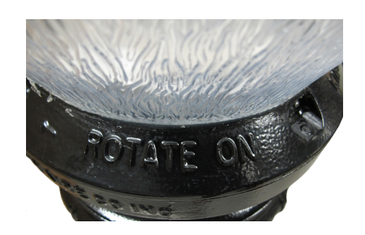
STEP 6: PLACE THE LED CONVERSION KIT GLOBE ON THE CAPITAL AND ROTOLOCK™ IT INTO PLACE OR ENGAGE THE SET SCREWS IF A NON ROTOLOCK™ GLOBE IS PROVIDED