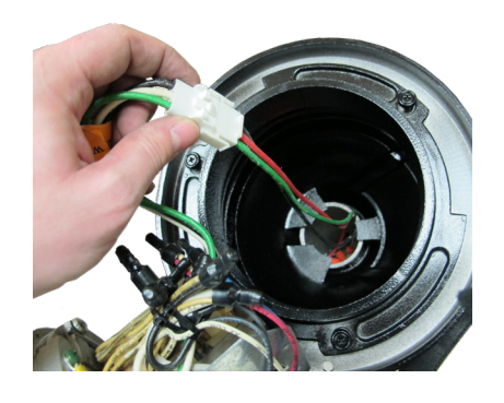
STEP 4: UNPLUG THE HID POWER LEADS FROM THE BALLAST ASSEMBLY