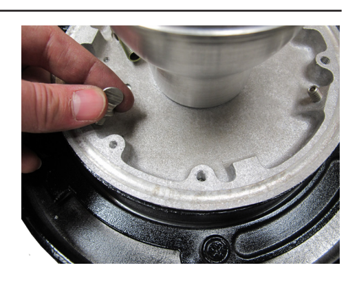
STEP 3: REMOVE THE BALLAST PLATE AND ASSEMBLY FROM THE HID FIXTURE