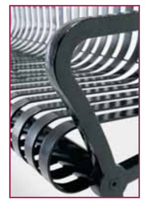
Standard, premium and custom paint colors available, please contact us for details.