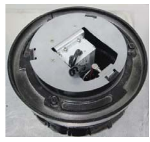
STEP 3: PLACE BRACKET IN CAPITAL