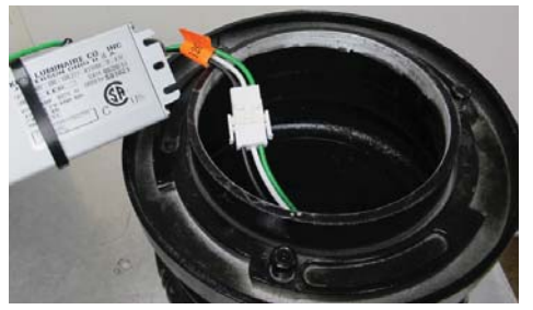
STEP 2: CONNECT WIRES IN CAPITAL TO DRIVER ASSEMBLY