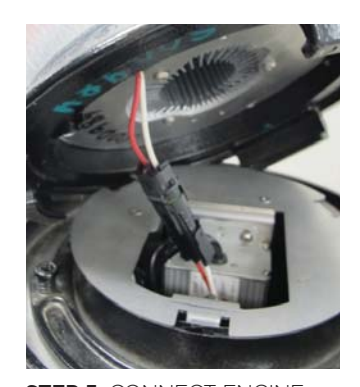
STEP 5: CONNECT ENGINE TO DRIVER ASSEMBLY