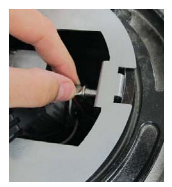
STEP 4: TIGHTEN SET SCREW