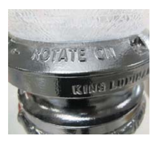
STEP 6: PLACE GLOBE IN CAPITAL AND TWIST TO ROTO-LOCK IN PLACE