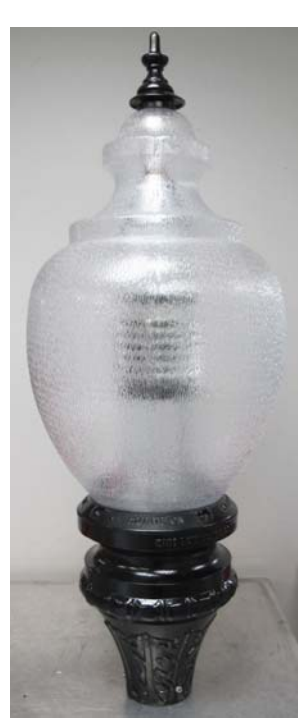
DRIVER REPLACEMENT COMPLETE